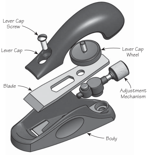
Figure 1: Pocket plane components.

The lever cap is molded to comfortably fit the palm of the hand. The lever cap wheel can be set from a full locking position to a controlled friction setting for blade adjustment. The combined feed and lateral adjustment mechanism makes blade setting accurate and easy.